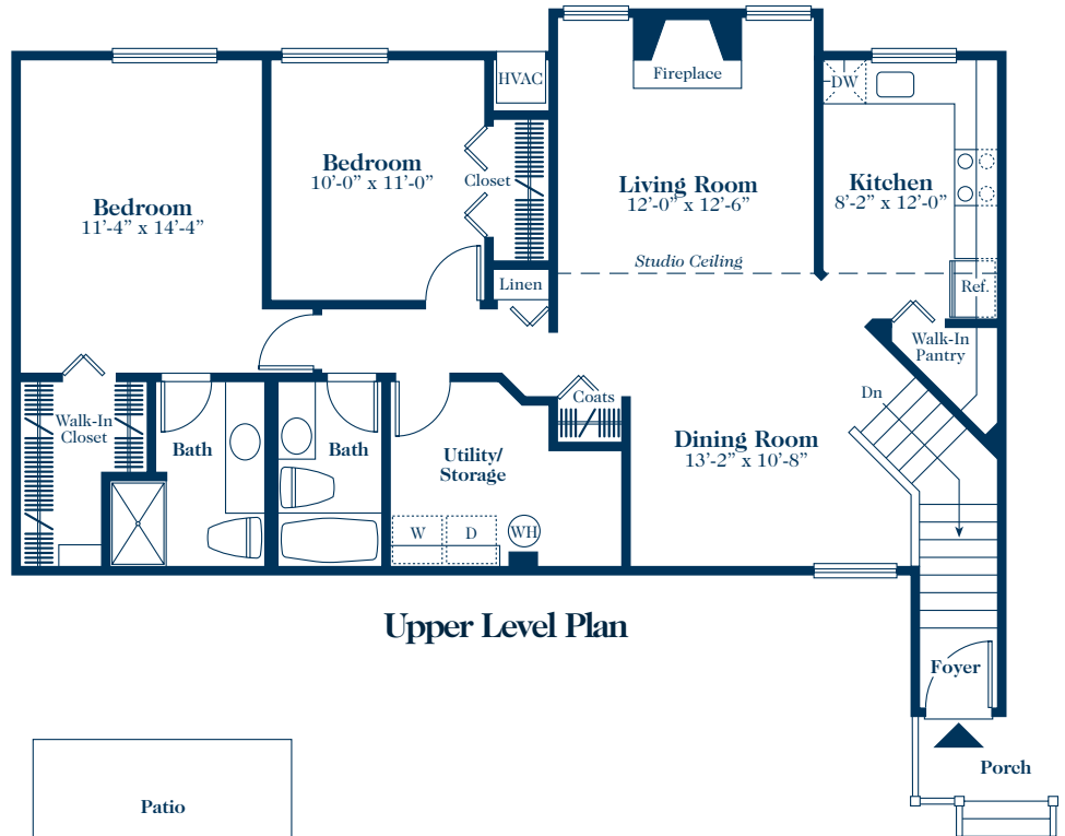
Upper Level Plan